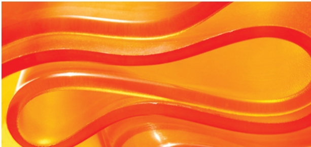
Gels — an intimate mixture of liquid and plastic—offers softness and cushioning for applications such as seating, footwear, and toys.

A Global Platform Material ConneXion is the gateway to the latest developments in the world of materials. Through its comprehensive network of resources, anchored by materials libraries in New York, Milan, Cologne, and Bangkok, Material ConneXion’s international team of material specialists provides a global, cross-industry perspective on materials and their potential uses. Forming a bridge between the creative power of designers and the real-world limitations of engineering, Material ConneXion helps companies identify practical manufacturing solutions. Its team provides material information for all disciplines of design development: product, packaging, architecture, interior, apparel, and more.