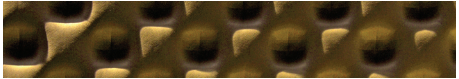
Bump — Thermoforming of skinned foams can create unique structure and visual effects.

Vision Material ConneXion was created in 1997 by George M. Beylerian to give its users a distinct advantage to discover the latest and most exciting materials originating from a large spectrum of industries. The materials libraries house the best of the best materials from eight categories: polymers, glass, ceramics, carbon-based materials, cement-based materials, metals, naturals, and natural material derivatives.