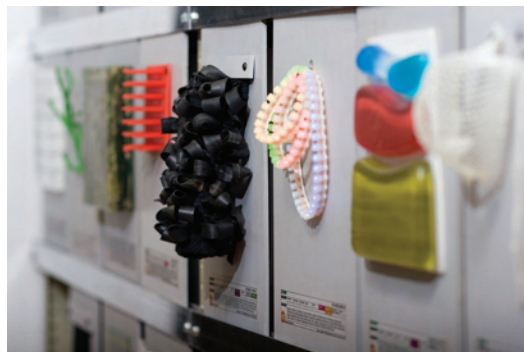
Material ConneXion’s New York Library — 4,000+ innovative materials offer solutions and inspiration for all design fields.

One Fact — For the client experience at One Haworth Center, Material ConneXion has focused on sustainable materials and how they can be used innovatively in a variety of applications.